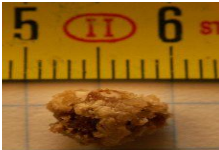
A formed kidney stone